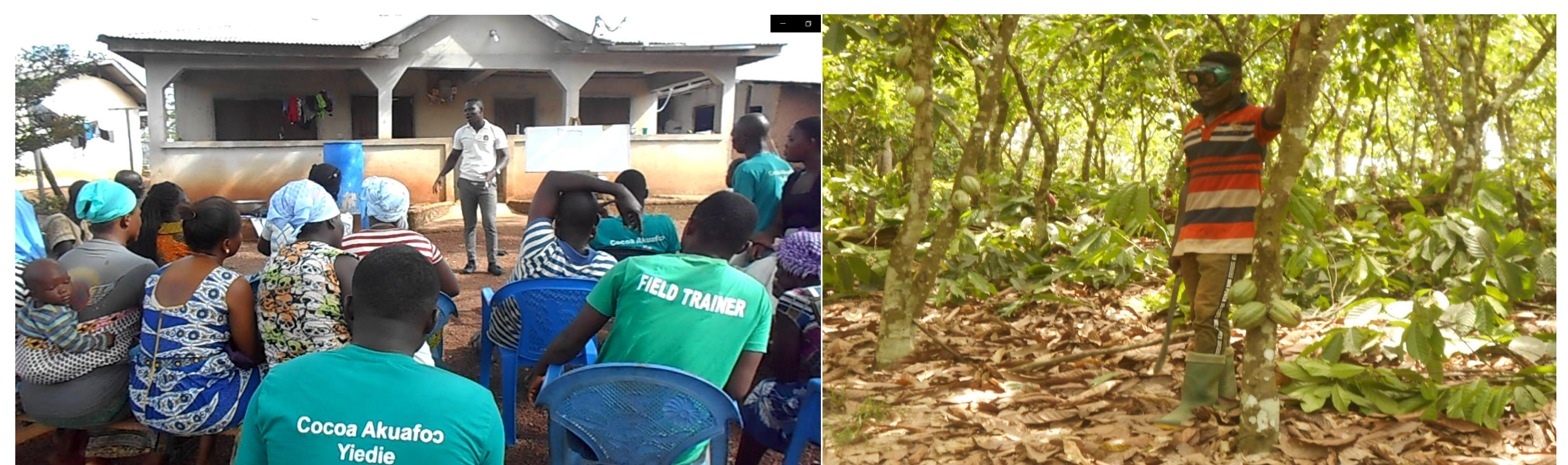
Plate. 1: Left. Mass training of farmers on pruning by technical officer. Right: Firm trained gang pruner pruning a farmer's farm