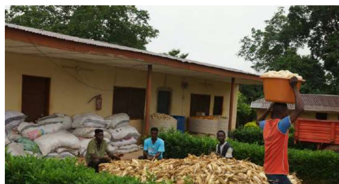
Harvested maize being processed