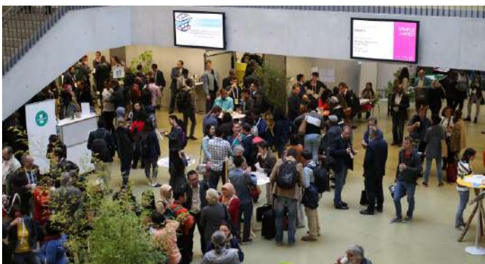
Participants interacting during coffee break