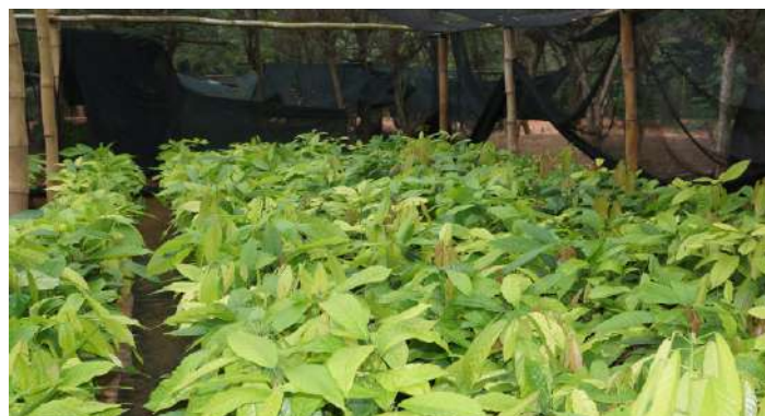
Cocoa seedlings in the nursery ready for planting

At the site, she inspected the maize storage area where the harvested maize was being processed. She also visited the cocoa nursery and the irrigation plant. The seedlings in the nursery are in good condition and ready for planting, while part of the irrigation system has been built and would be completed soon.