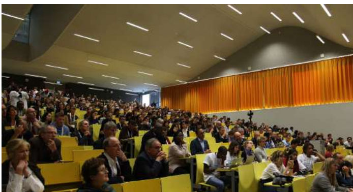
A cross-section of participants at Tropentag 2019