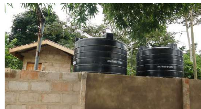
Irrigation system partly built

Contribution by: Ekatherina Vasquez ekatherina1.vasquezzambrano@wur.nl