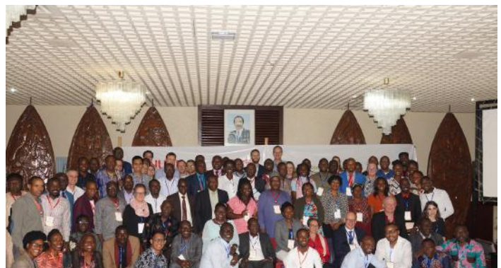
Group picture of all participants at the Annual Forum