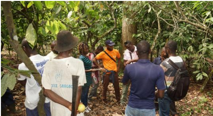
Participants in the field for hand-on data collection session