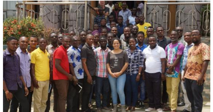
Group photo of participants with facilitators in Ghana