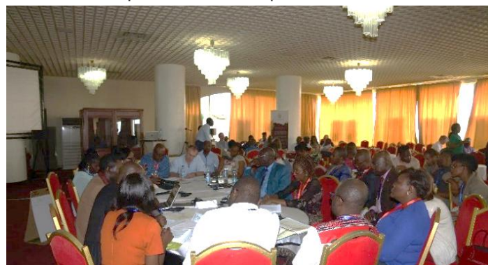
Participants discussing during group sessions

chairs of each national Partnership Committee. In these breakout groups, the participants discussed the context of each committee in detail and shared feedback with the chair to improve their work plans for 2020.