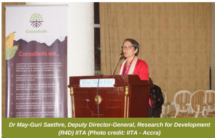
Dr May-Guri Saethre, Deputy Director-General, Research for Development (R4D) IITA

presence of the Minister at the forum is a strong indication of the importance of cocoa production in Cameroon. She stated that "25% of the cocoa tree population produces 2/3 of the cocoa production, thus the need to promote intensification". She added that the presence of over 40 institutions at this forum is an opportunity to create synergies as each participating institution indicates a role they can play.