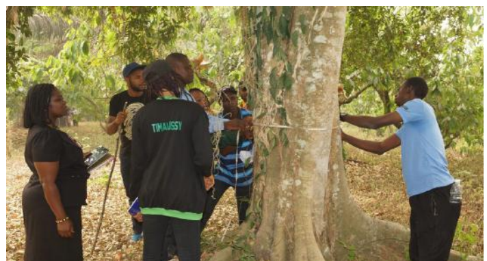
Partner technicians in the field measuring shade cover and the DBH of the tree