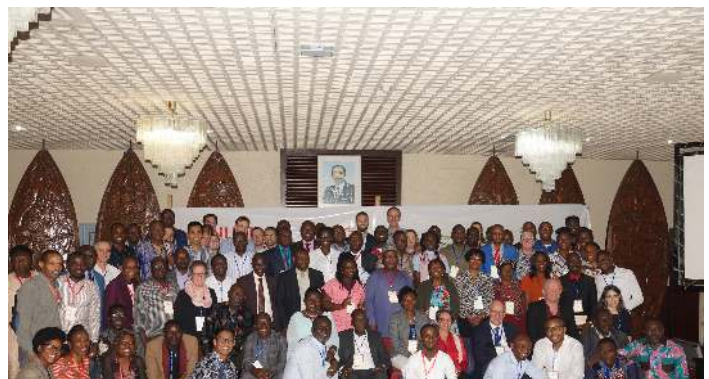
Group picture of all participants at the Annual Forum