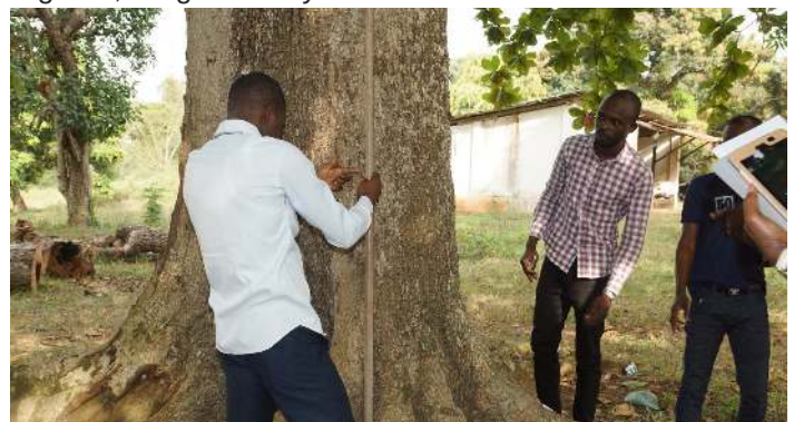
Partner technicians in the field measuring shade cover and the DBH of the tree