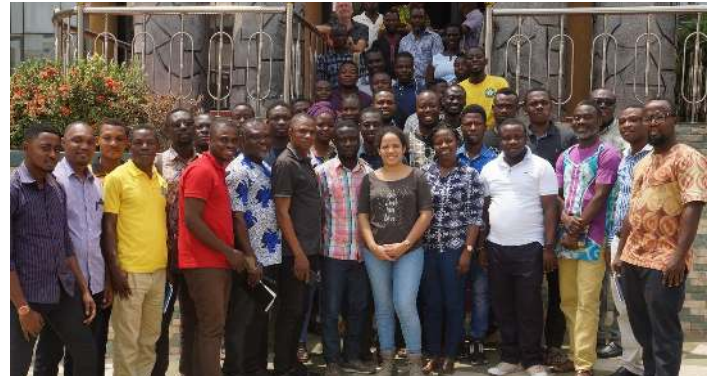
Group photo of participants with facilitators in Ghana