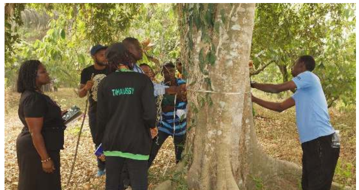
Partner technicians in the field measuring shade cover and the DBH of the tree