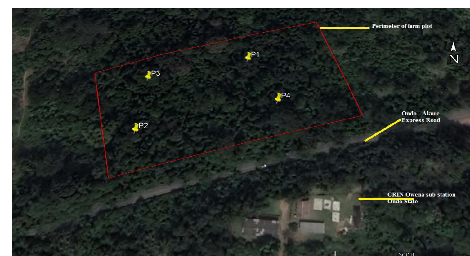
Locations of Profile pits in the site