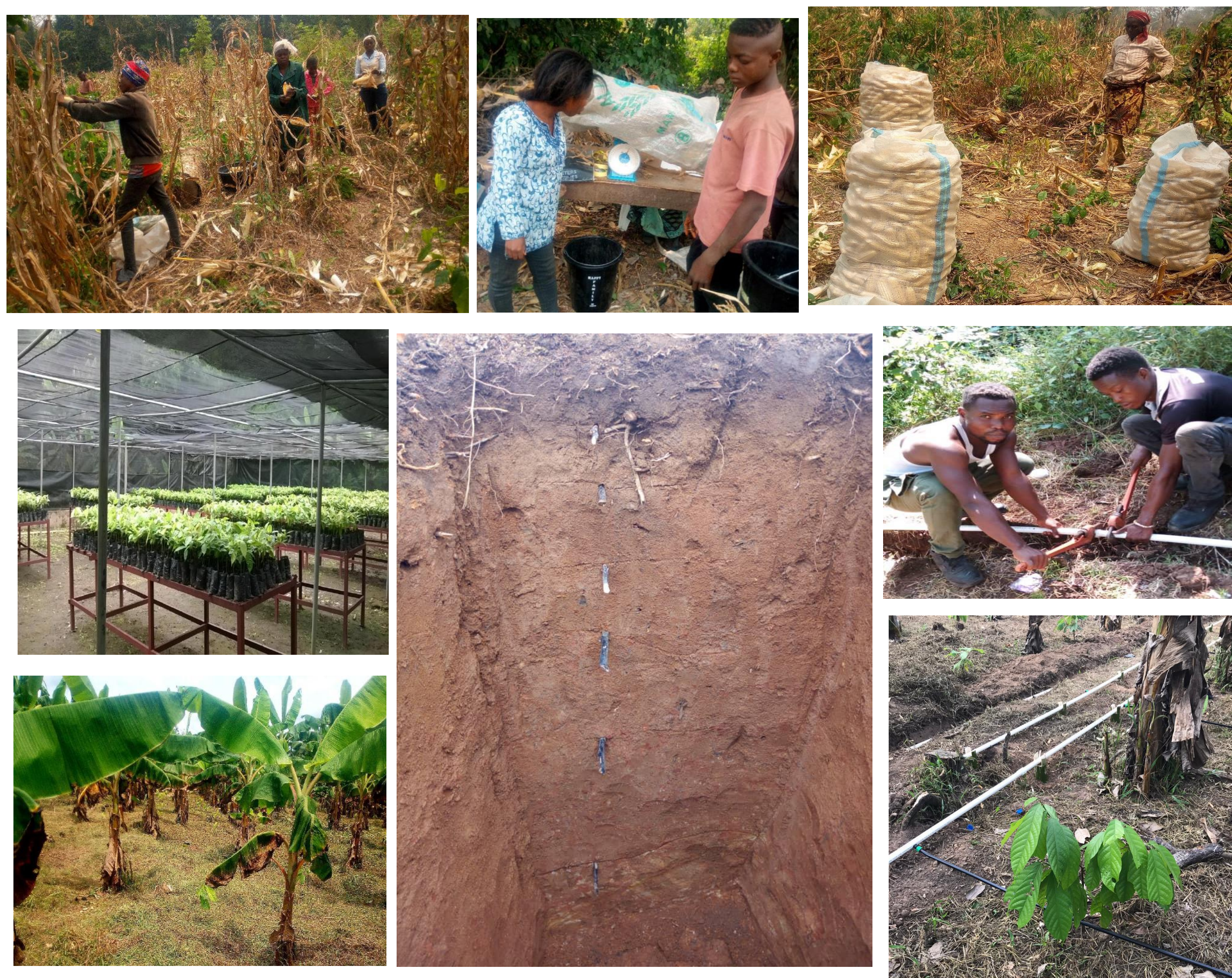
Nursery and field activities in pictures